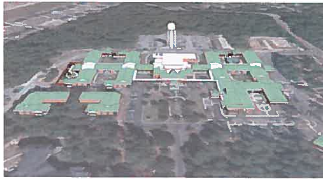
HOUSEHOLD MODEL ARCHITECTURAL DRAWING - ESTIMATED COMPLETION 2015