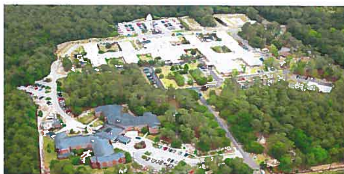
AERIAL VIEW - MAY 2011